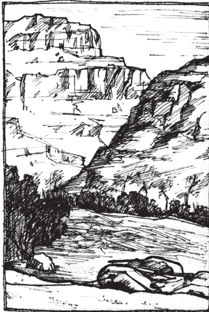
Pen and ink by Sarah Clinger

Printed on Vision 100% tree-free paper made from the kenaf plant.